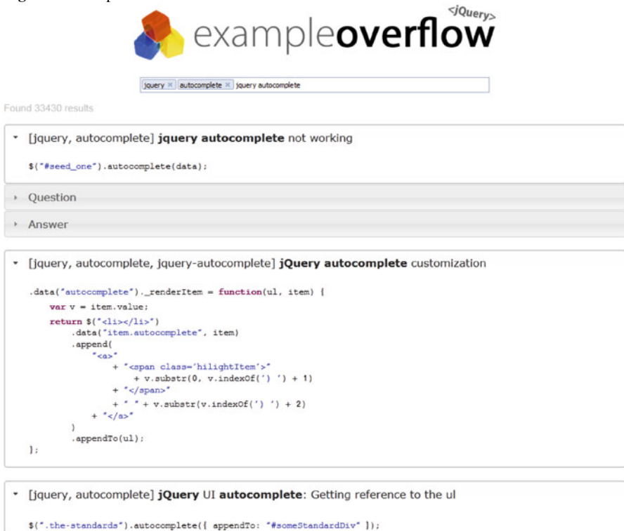
Fig. 15.3 Example overflow Web interface

Example Overflow development is aligned with the theory of the Example Embedding Ecosystem [6] – an example centric development approach which argues that the use of examples in professional software development goes beyond being a mere programming technique, or the use of a specific code retrieval tool. Usage of existing code should rather be considered as a fundamental software construction activity and an expression of community knowledge accumulation and of the software reuse principle. Habitual and methodological example usage expresses awareness of the existing body of knowledge and promotes faster and better code writing. Developers and organizations that implement the Example Embedding theory explicitly address example usage concerns in their development process, software tools, practices, training, organization culture and more [6] (Fig. 15.3).